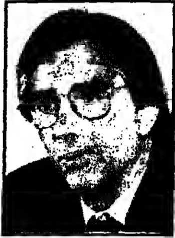
Dennis Ross.

US special Mideast envoy Dennis Ross is arriving today on an urgent mission to try to prevail on Israel and the Palestinians to exercise maximal restraint and avert the eruption of violence on Sunday's Land Day.